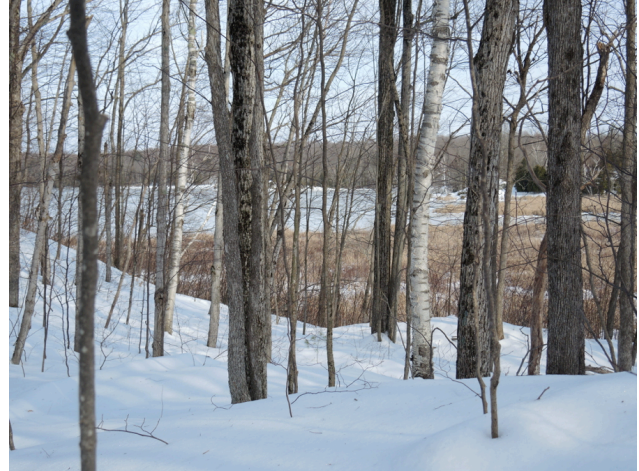
Charleston Lake Park