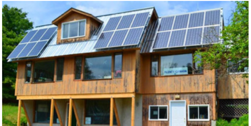
Sustainability Centre at Plenty

At Plenty Canada we recognise that people are part of the environment and we sustain healthy lives only when the environment as a whole is healthy. For us the environment and the bio-diversity of our environment are a precious treasure we need to protect.