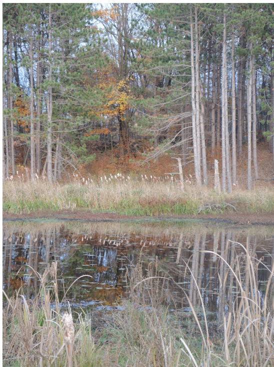
Black Rapids Wetland

https://www.afocl.org/donations/donation-form/