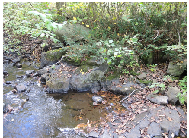
Along the A2A Trail, Leeds and Thousand Islands Township, Ontario

We believe the A2A Trail will inspire people who live in or visit the A2A region to get involved, to stand up for the wild and an A2A region that is healthy and vibrant – for wildlife as well as for our own well-being.