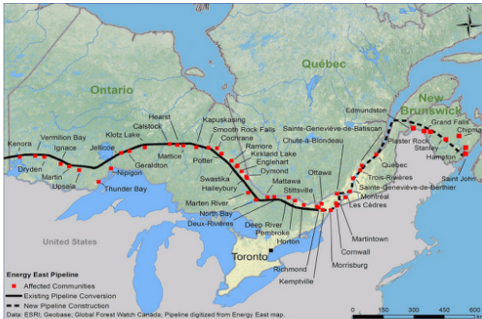
The solid line shows the proposed repurposing of an existing gas pipeline through the A2A region; the dotted line the proposed extension

A2A has been granted intervener status and funding to assess the potential impacts on the A2A region, particularly on wildlife habitat and connectivity, water quality, and social impacts. We will also investigate safety and spill response plans. A2A will be arguing that this pipeline's contribution to global climate disruption, possibly the greatest threat to our region's wildlife and people, should also be allowed as evidence by the National Energy Board in determining whether or not it should be built.