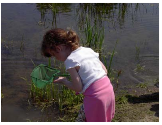
At the CRCA's environmental education programs, surfing the net takes on a whole new meaning.

But that doesn't mean that rural people always take advantage of having nature in their own backyard. Many of us take it for granted.