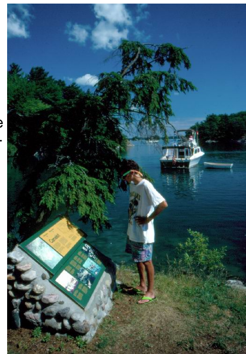
A summer visitor learns about the Park.